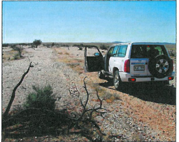
Promising: Quartz flats at the Kink Prospect.