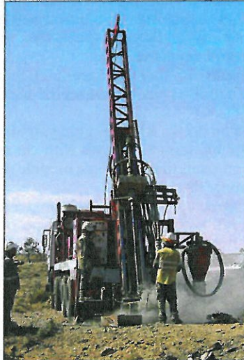
Work under way: Drilling at New Bendigo.