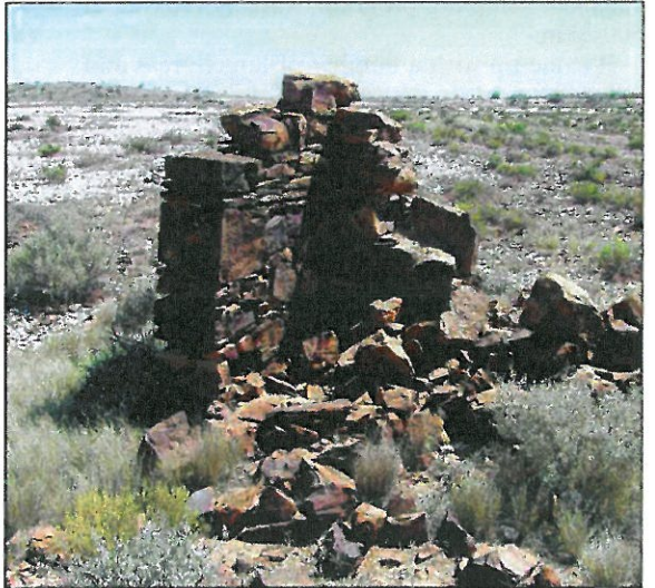
Fallen structure: A New Bendigo miner's hut in ruins.