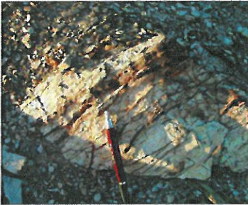
Exciting prospect: New Bendigo mineralised stockwork.