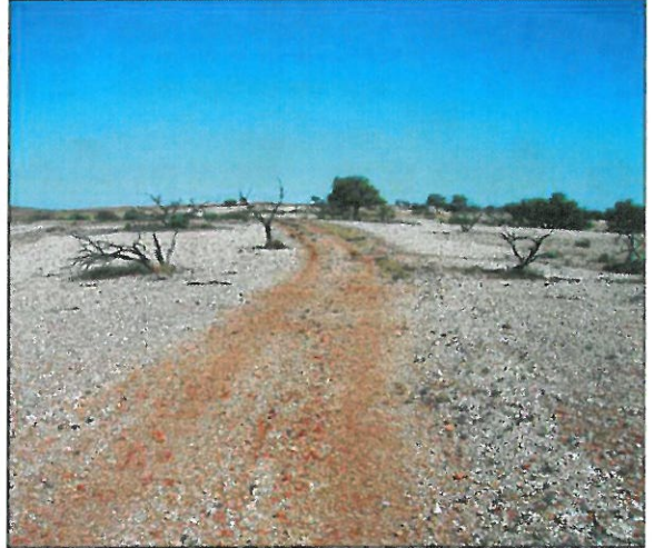
Exploration: A drilling area at the Kink Prospect.