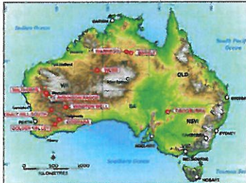
The big picture: Meteoric has several exciting projects across Australia.