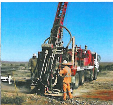
Drilling deep: Meteoric Resources workers begin 600-m of the Kink Prospect.